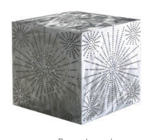
Brushed Burnished Steel